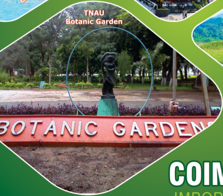
TNAU Botanic Garden