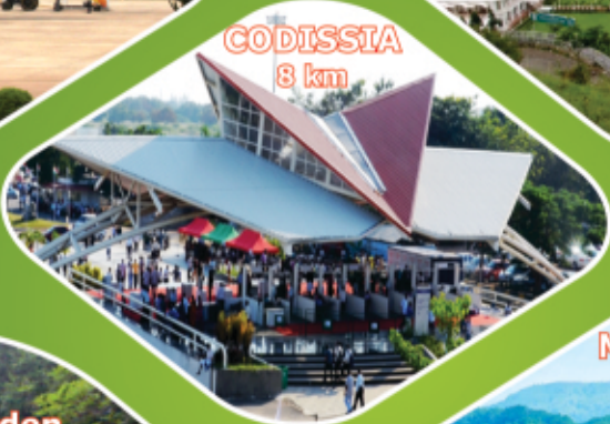
CODISSIA 8 km