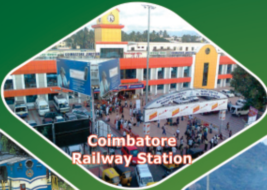
Coimbatore Railway Station