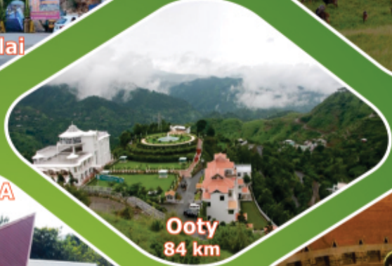
Ooty 84 km