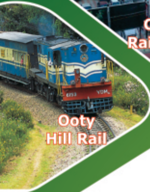
Ooty Hill Rail