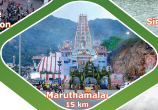
Maruthamalai 15 km