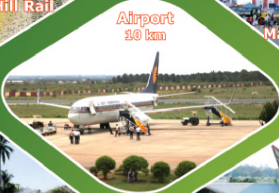
Airport 10 km