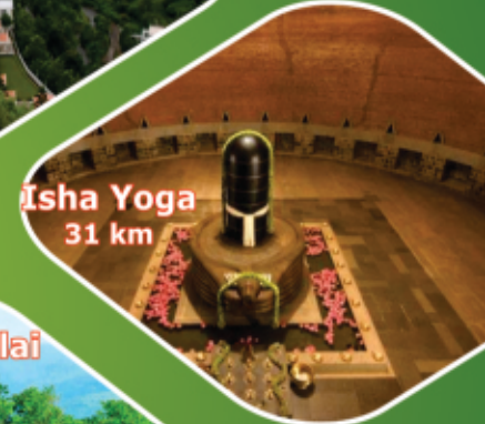
Isha Yoga 31 km