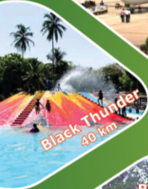
Black Thunder 40 km