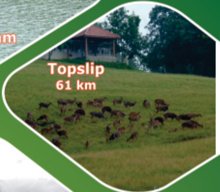
Topslip 61 km