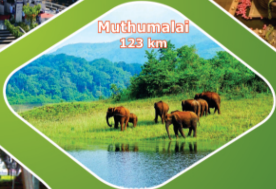
Muthumalai 123 km